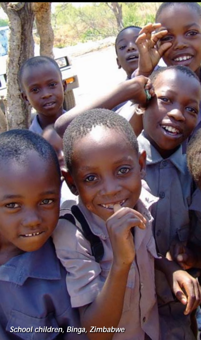
School children, Binga, Zimbabwe

Empowering the Future of Developing Nations