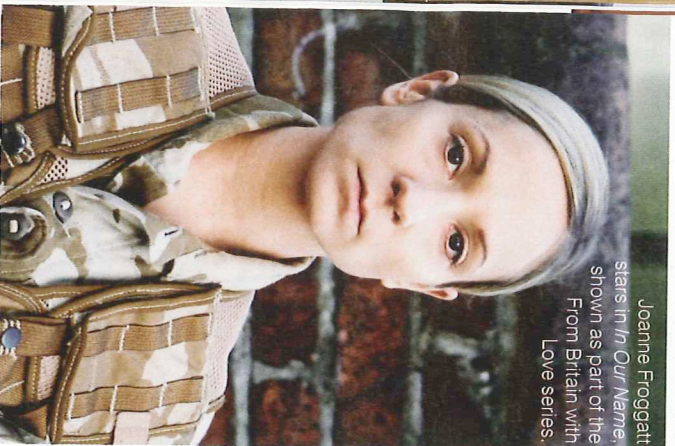
Joanne Froggatt stars in In Our Name , shown as part of the From Britain with Love series.

Take in a movie at Silas Marder Gallery's Film Screening , this week's film is Singin' In The Rain . 120 Snake Hollow Rd., Bridgehampton, 702-2306; silasmarder.com